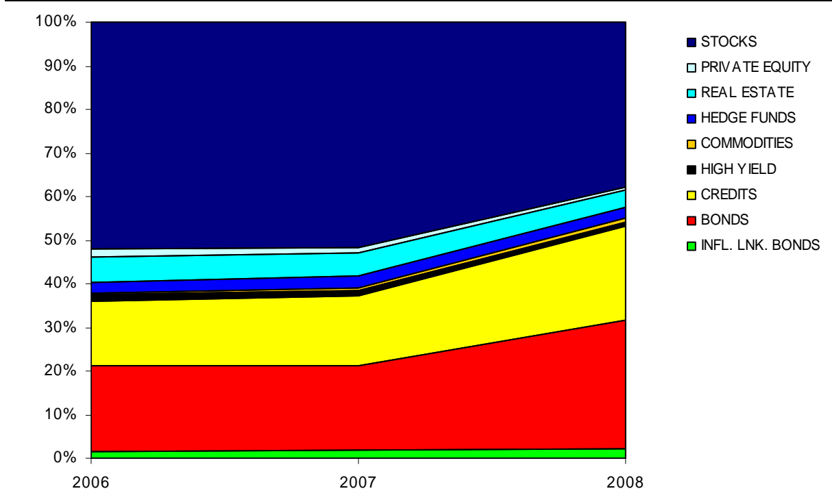
FIGURE B.1 ESTIMATE OF THE MARKET PORTFOLIO FROM 2006 TO 2008

Figure B.1 shows the market portfolio from 2006 to 2008.